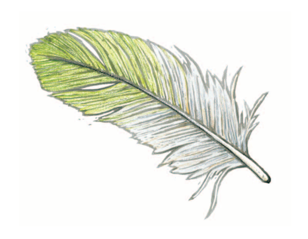
Ministry of Education