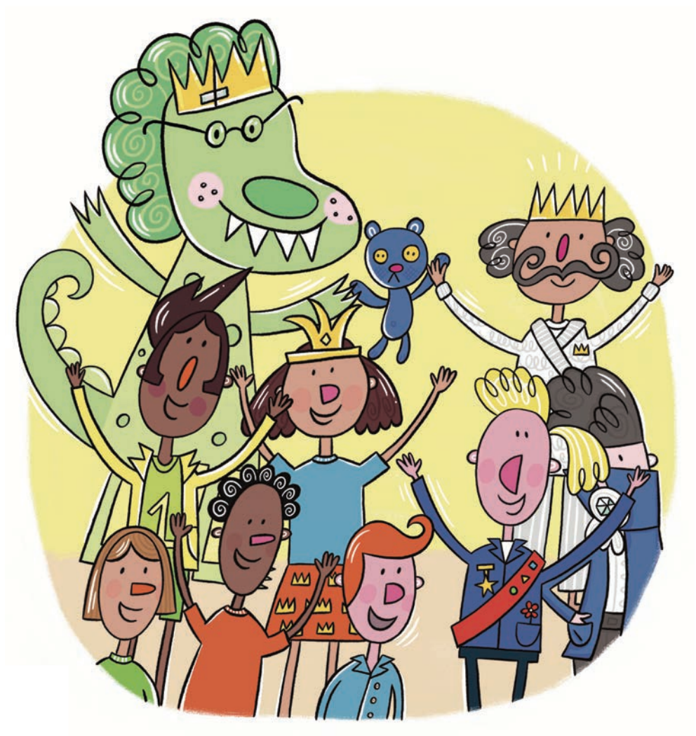
illustrations by Beck Wheeler